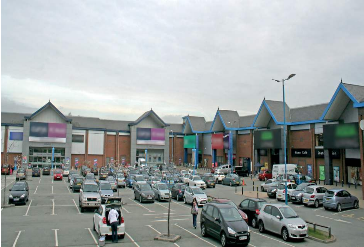
Out-of-town shopping mall